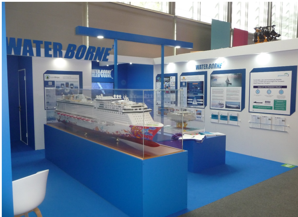
Waterborne booth TRA 2018 Vienna with cruise vessel "Genting Dream".

The eyecatcher at the Waterborne booth was the cruise vessel "Genting Dream", a ship of 335 metres length, 39,7-metres width and over 150,000 GT, built by Meyer Shipyard in Papenburg and designed for the Asian cruise market.